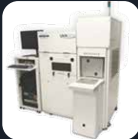
Insight CAP HP