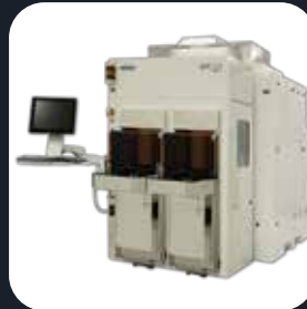
JVX 7300 HR