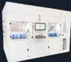
REVASUM 6EZ Polisher