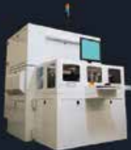
REVASUM 7AF-HMG Grinder